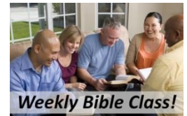
Weekly Bible Class!