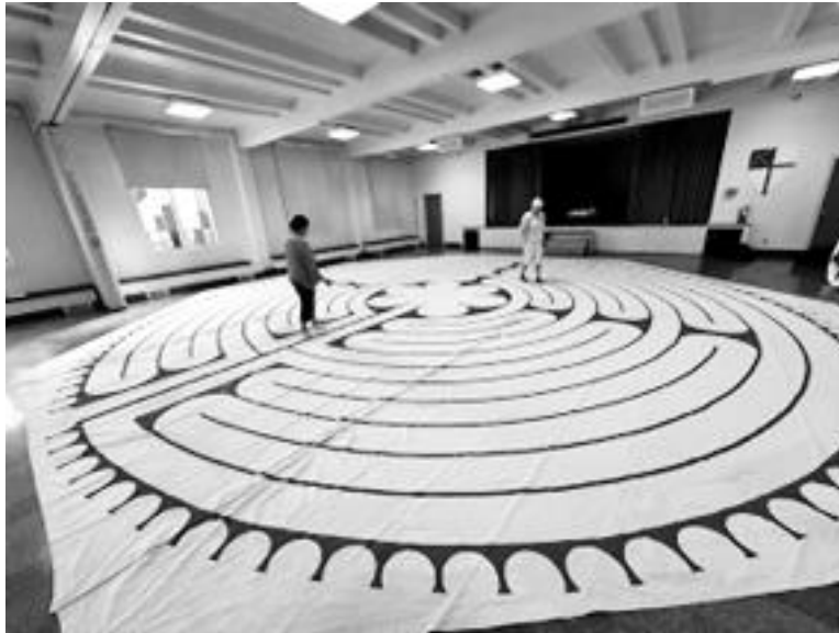
The labyrinth in use in the Parish Hall

in previous years traveled to Camp Galilee, the Carmelite Monastery, the Diocesan Convention and other locations.