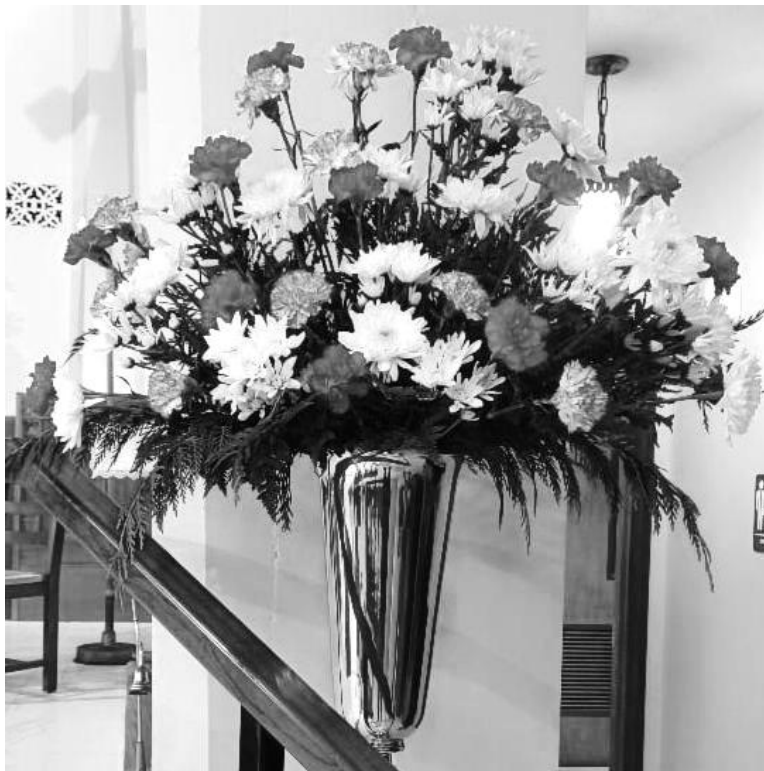
A beautiful example of the work of the Flower Guild

With concerts in our church, we are routinely visited by guests. The beauty of the flowers is regularly commented on.