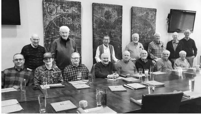
Members of ALOGM at their December Lunch