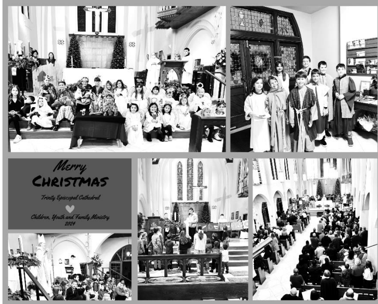
Sunday School students participating in their Christmas Eve Nativity Pageant