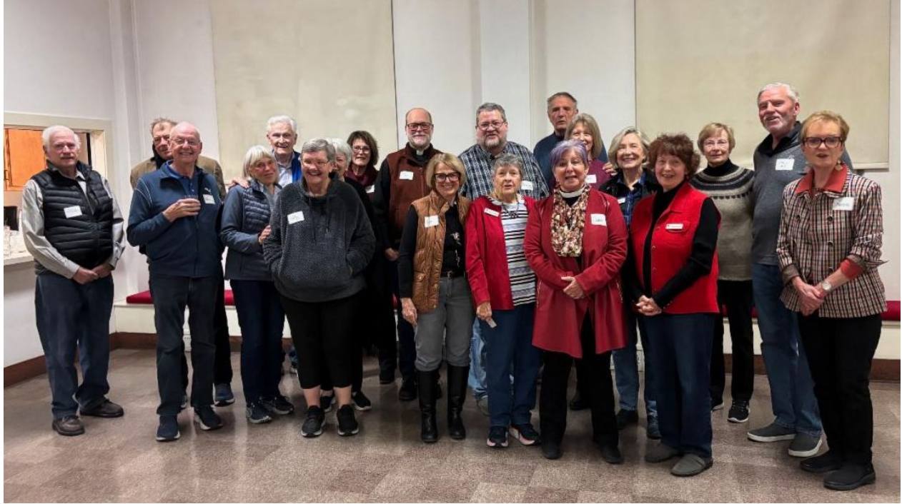
Attendees at November's Common Table