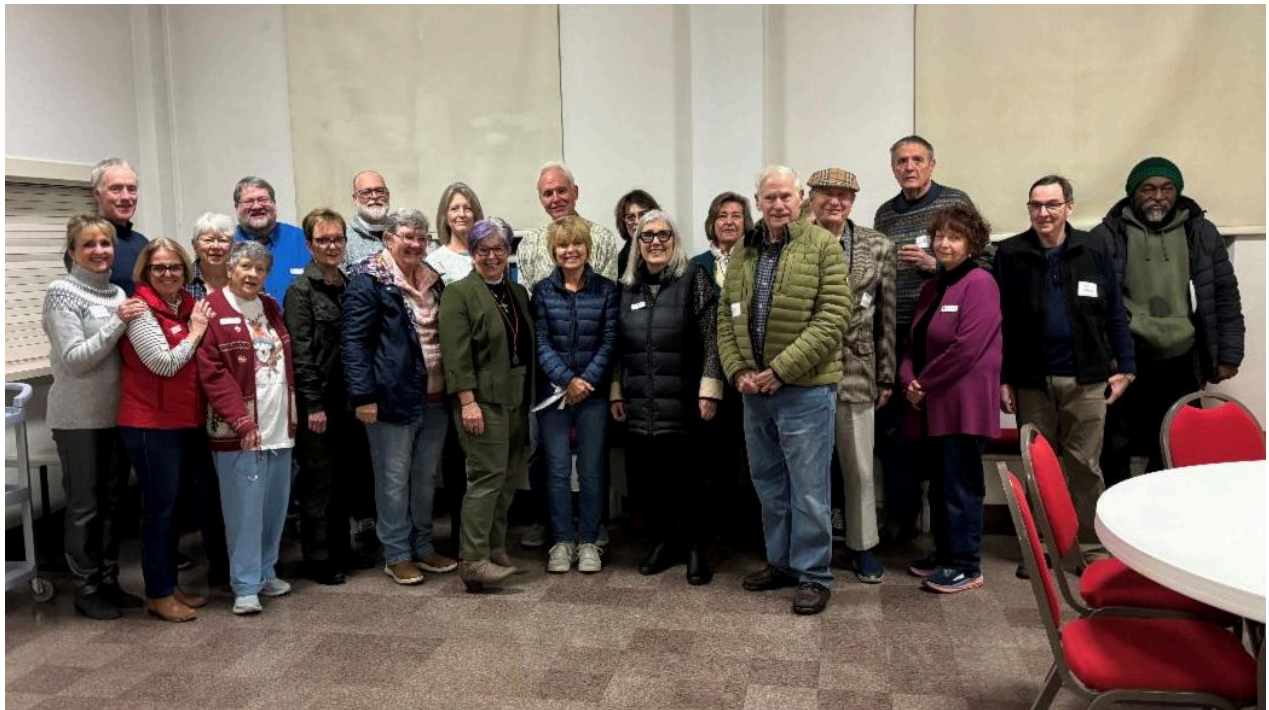
Participants at January's Common Table