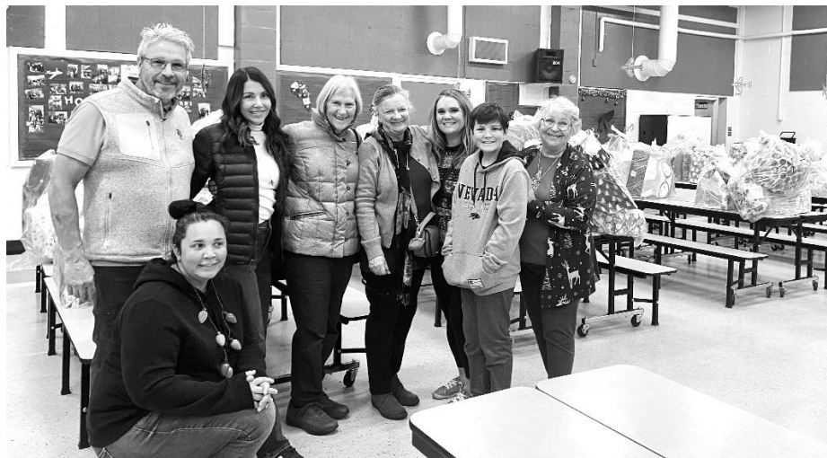
Members of the 2025 Angel Tree team with Stead Elementary staff