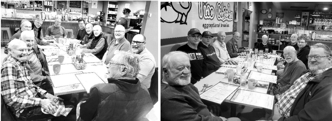
Members of ALOGM at their December Breakfast

Check The Carillon for times and places of the meals each month. There are no strangers!