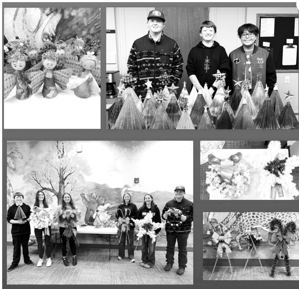
Sunday School students participate in their annual Christmas Craft and Bake Sale

The Children, Youth, and Family Ministry is responsible for a lot of the little magic that happens at our 9 a.m. service, such as providing worship bags and maintaining an art table for our youngest members. In addition to our involvement in the 9 a.m. service and Sunday School, we have poured our hearts into hosting events for our Trinity community at large. This past year we hosted a Shrove Tuesday Pancake Dinner in February, our Annual Egg Hunt in March, Trinity's Summer Picnic in June, and a Spaghetti Dinner in September. We ended the year by hosting an Advent Family workshop, a holiday bake and craft fair, and the presentation of The Nativity Pageant on Christmas Eve.