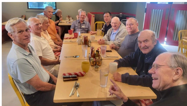
ALOGM enjoys their May breakfast